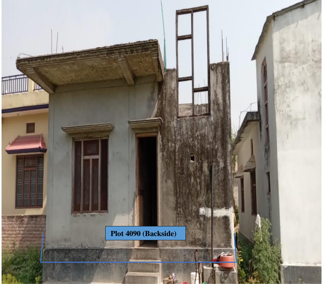
Plot 4090 (Backside)