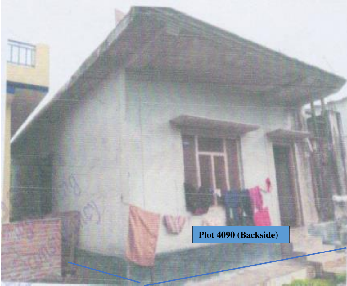
Plot 4090 (Backside)