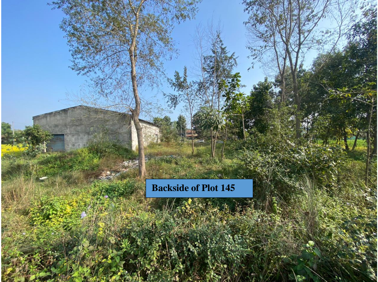
Backside of Plot 145