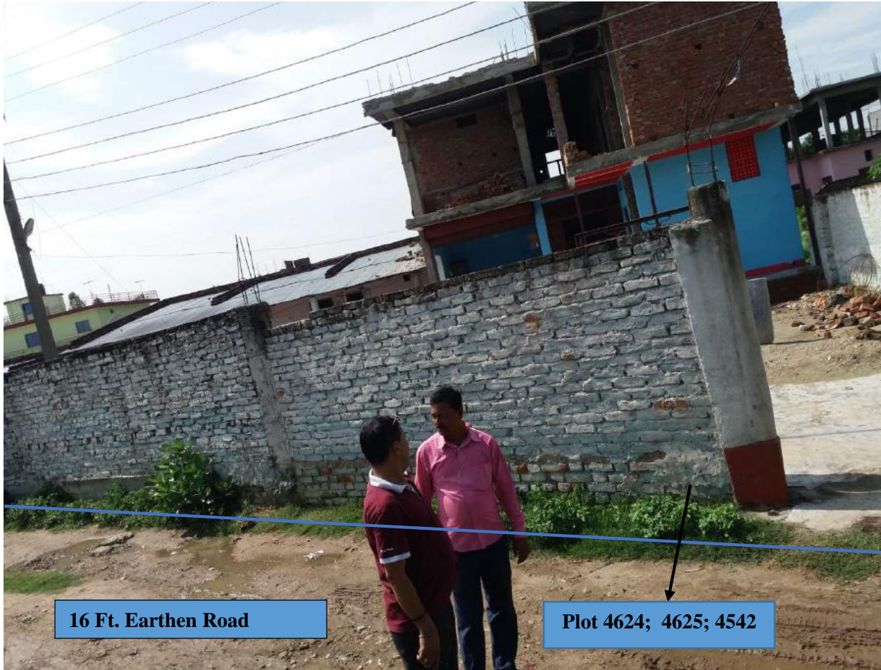
16 Ft. Earthen Road