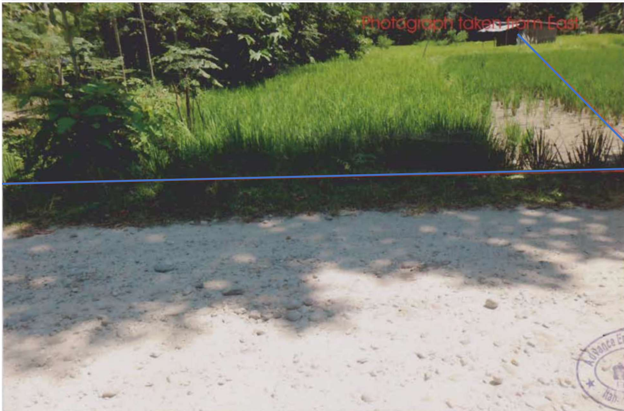
VIEW OF THE PROPERTY FROM PLOT NO- 127, 332, 110 (Anarmani -1, Jhapa)