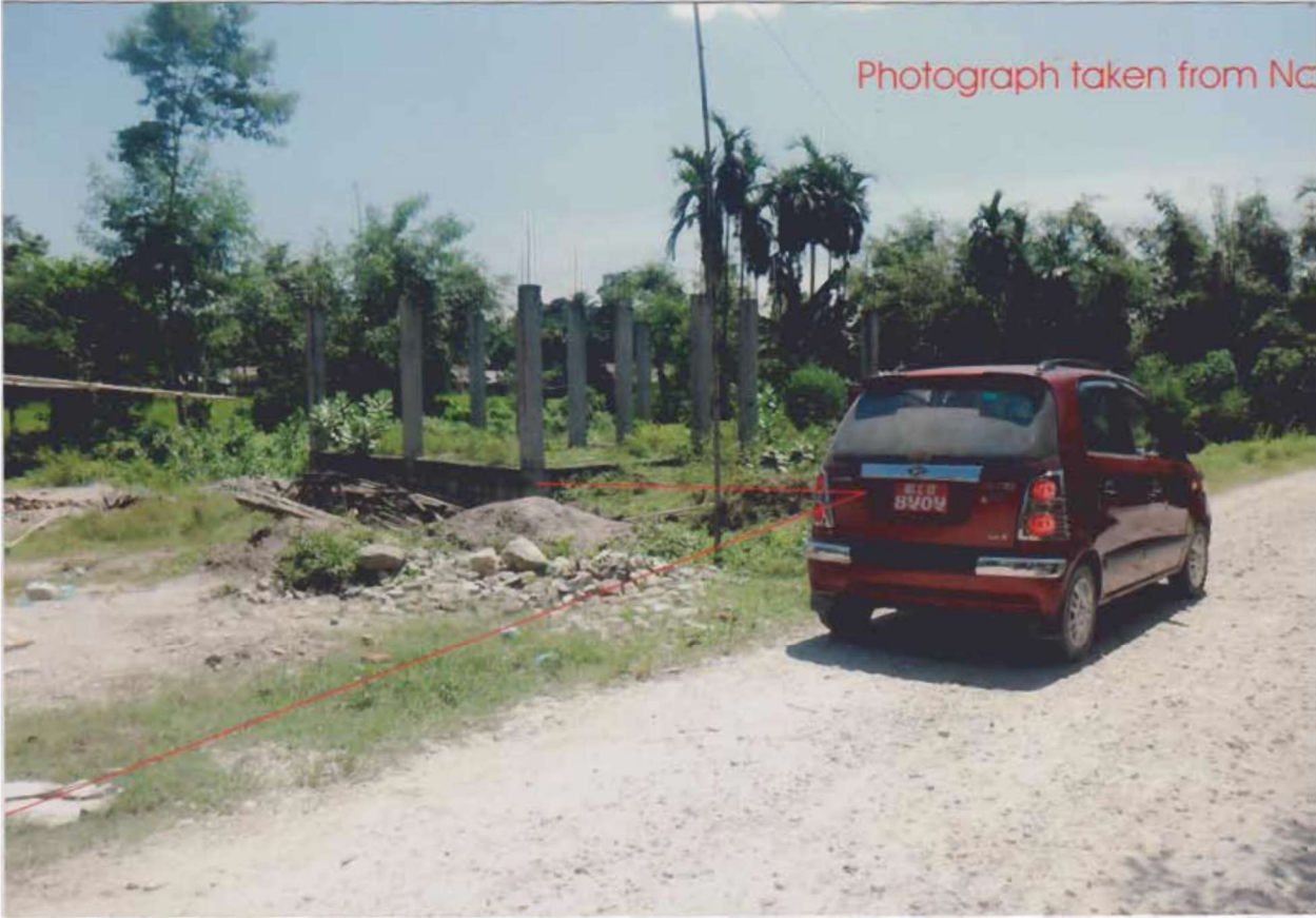
Photograph taken from Na